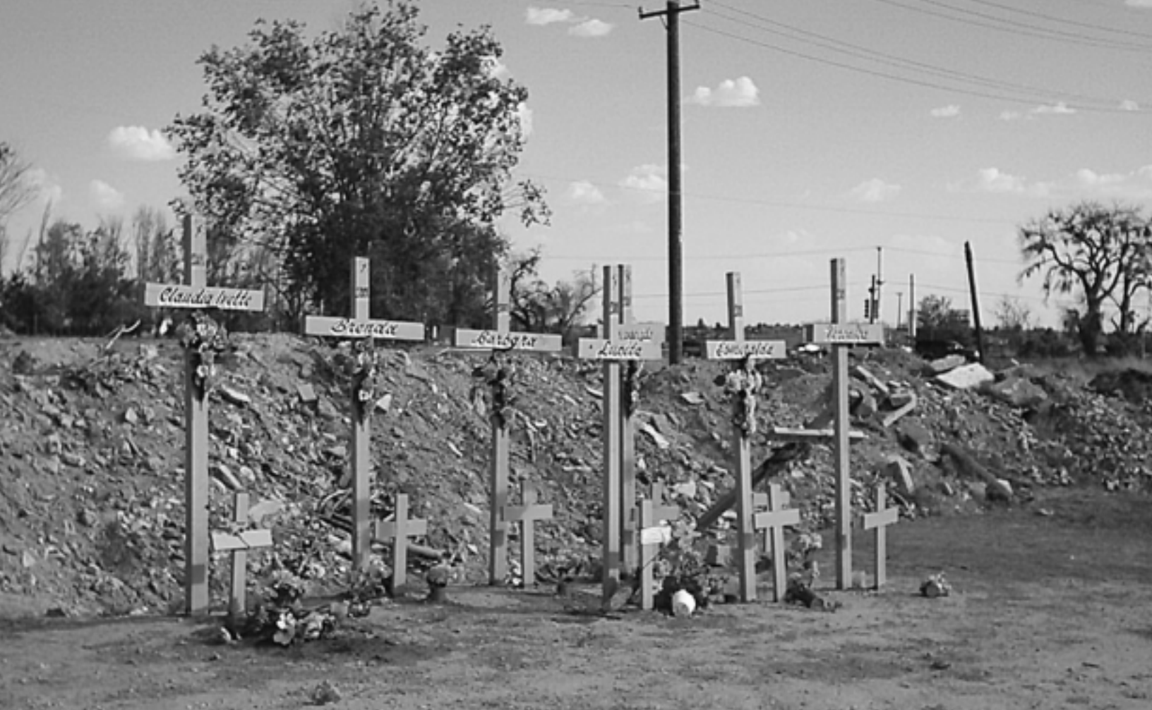
Pink crosses representing the victims found at Campo Algodonero.

Mary Robinson. Zedillo's successor, President Vicente Fox, followed by signing a Technical Cooperation Package with the UN one day after entering office in December 2000. México's collaboration with the UN addressed five themes: National Human Rights Initiatives; Indigenous Rights; Administration of Justice; Economic, Social and Cultural Rights; and Vulnerable Groups, particularly children and migrant laborers. 25