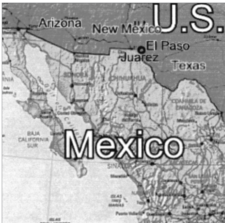
Map illustrating Ciudad Juárez's proximity to the United States.

young men later retracted confessions signed in custody, stating that they had been tortured. In 1999 and 2001, two groups of bus drivers known as " los choferes " were detained on similar charges.