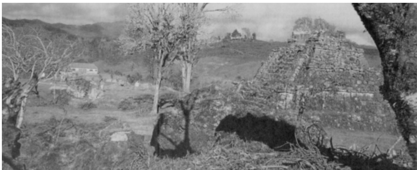
San Francisco de Netón site

In an exhaustive study released in February 1999, the UN Guatemalan Commission for Historical Clarification- created as part of the peace agreements- concluded that more than 90% of the human rights violations that occurred during the