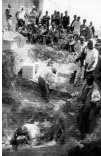
EAAF excavation underway at Alaba Kulito.

In both Butajira and Alaba Kulito, the victims were reportedly under police custody when they were killed. According to witnesses, in both cases the victims had been taken from their cells at the local police stations and executed on the outskirts of the towns. Placards accusing the victims of anti-revolutionary activities were attached to their bodies, which were publicly exhibited in the town and other public spaces for several hours following the executions. The bodies then disappeared. Although the police made efforts to conceal the location of the burial sites — even digging false graves to mislead witnesses — it was widely believed that the victims had been buried in the police stations of the respective towns. The families of the victims were expressly forbidden to mourn by the authorities.