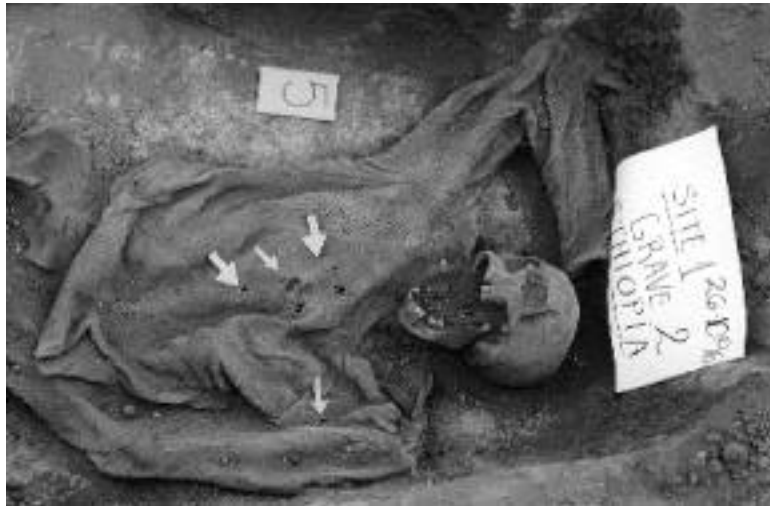
One of the skeletons exhumed at Alaba Kulito. The arrows indicate bullet holes in the victim's sweater.

probability of different matches for the purposes of identification. All the genetic tests are currently being conducted at the laboratory of Dr. Mary Claire King at the University of Washington at Seattle. Through DNA analysis, the lab has positively identified four individuals whose remains were exhumed during EAAF's 1994 mission to Ethiopia.