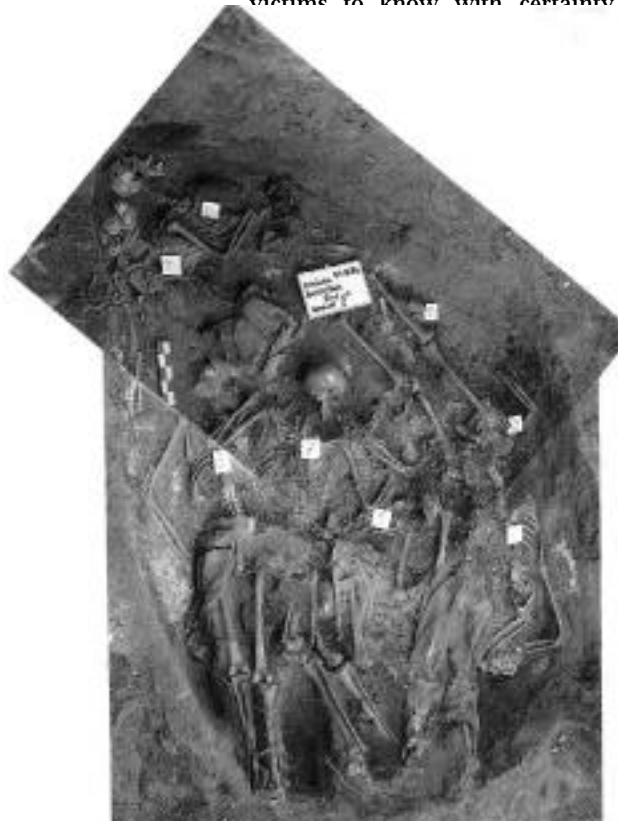
Right: Mass grave exhumed at Butajira containing the remains of Red Terror victims.

should not appear before the court until later. As of this writing, the trials are still in process. Dr. Clyde Snow, an American forensic anthropologist who participated in EAAF's 1994 mission to Ethiopia, and two EAAF members may return to Ethiopia in to testify in the near future.