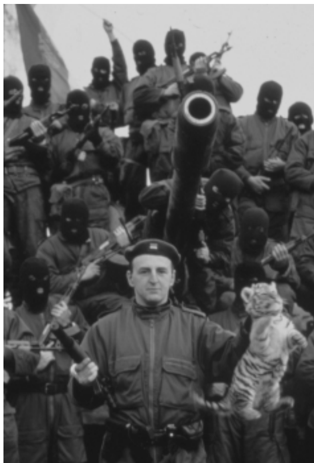
Zeljko Raznatovic, aka Arkan led a Serbian paramilitary force known as the Tigers which allegedly perpetrated some of the earliest instances of "ethnic cleansing" during the 1991 war in Croatia and similar atrocities during the war in Bosnia. On January 15, 2000 he was assassinated in Belgrad.

ICTY former prosecutor Richard Goldstone has brought charges against nineteen individuals who have been accused of committing acts of Genocide, violating the Laws and Customs of War, committing breaches of the Geneva Convention, and committing Crimes Against Humanity in relation to the camps. They have been accused of