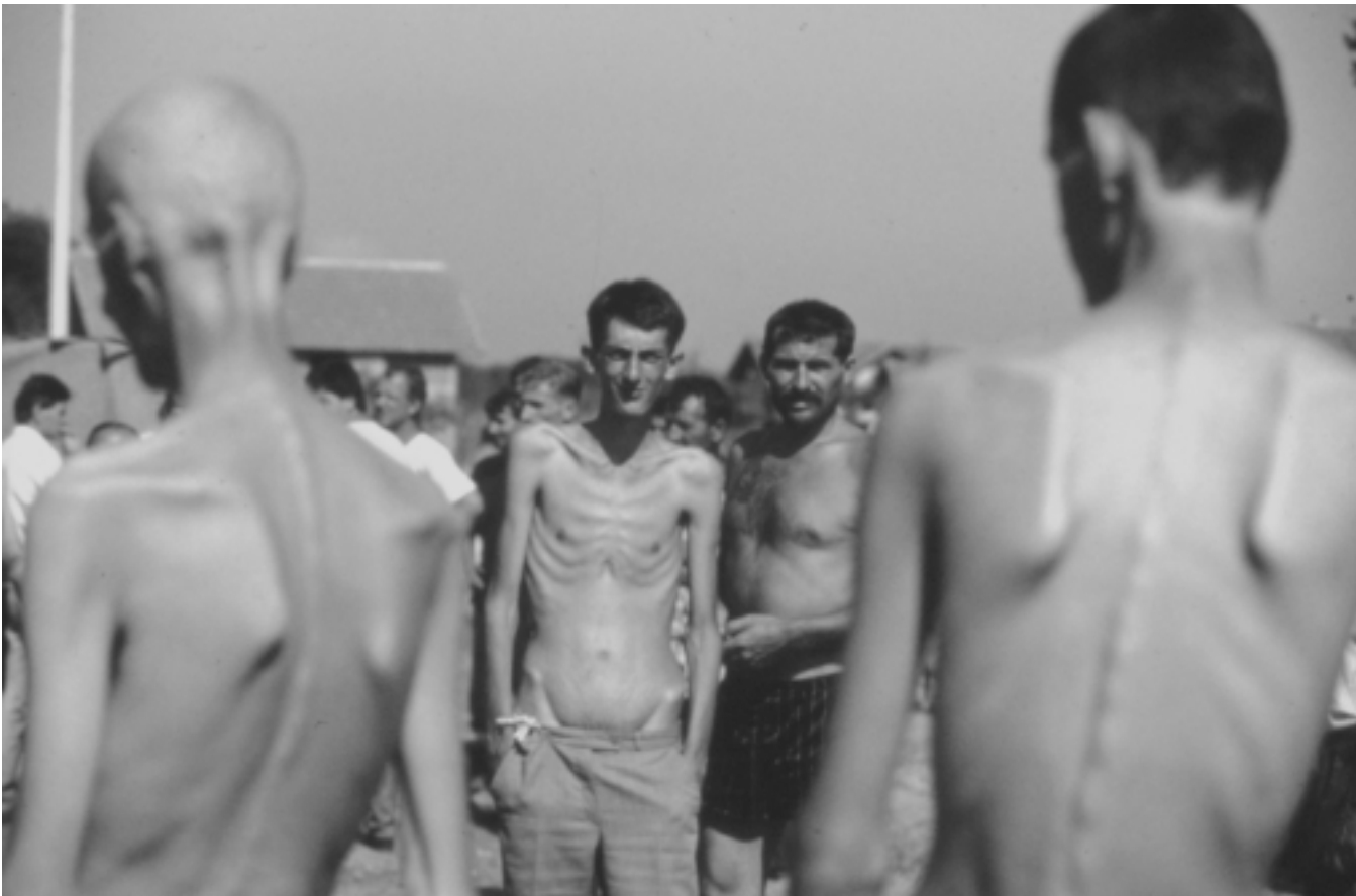
Detention center camp. Trnopolje, Bosnia, August 25, 1992.

Omarska, Keraterm, and Trnopolje were concentration camps in and around Prijedor. Dispatches, a British documentary series, released in April 1993, provided some of the earliest evidence of the camps and featured footage of the Omarska and Trnopolje camps, as well as interviews with their survivors 6 . Ed Vulliamy of The Guardian and Roy Gutman of Newsday were also among the first to uncover and gain access to the concentration camps of the Prijedor area in