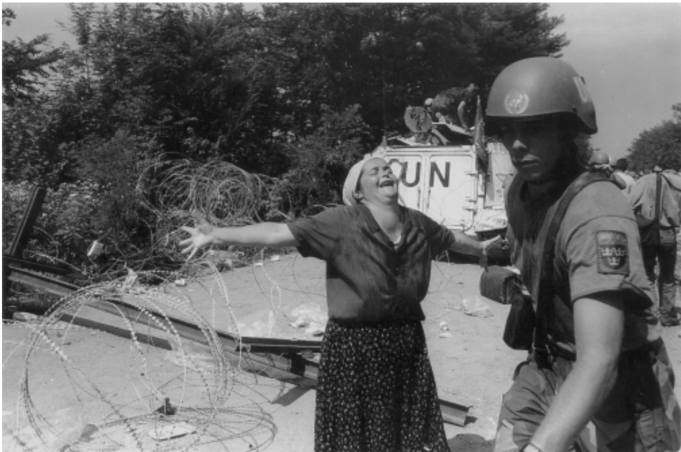
Tuzla, Bosnia, July 19, 1995. A Muslim woman forced out of Srebrenica.

A small Bosnian Government batallion of 2,000 men was also located in Srebrenica; these troops used the town as a base for conducting raids against nearby Serbian forces. During some of these raids, the Bosnian government soldiers allegedly killed a number of Serbian civilians. However, the Bosnian government batallion was ill