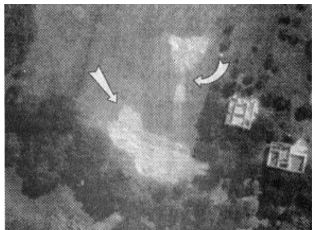
The United Nations released a photograph said to show a possible mass grave. The straight arrow indicates recently disturbed earth. The curved arrow points to embankments next to vehicles.

At the same time, the BSA troops took buses of women, children and elderly refugees to Tuzla, a city on the Bosnian side, where other surviving refugees also eventually regrouped. International Red Cross officials at the site, who had made a list of refugees there, estimated that over 6,000 of the refugees who had been in Srebrenica were missing. The massacre is described by human rights groups as the worst one in Europe since World War II.