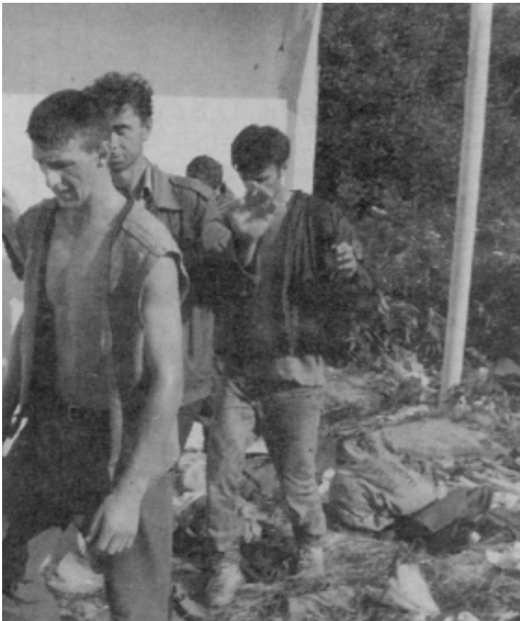
Muslims surrendering to Serbs outside of Srebrenica. July 14, 1995.