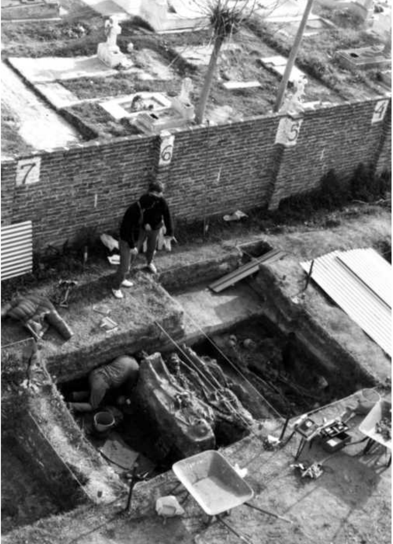
The wall separating Sector 134 from the rest of the cemetery was constructed after the military coup in 1976. Most remains exhumed in this sector had been buried naked.