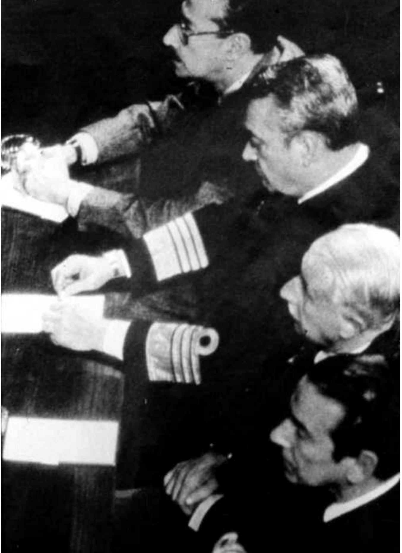
Buenos Aires, 1985, Junta Trials of the three military juntas that ruled Argentina between 1976 and 1984.