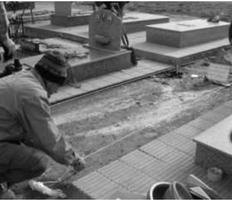
Left: Delimiting the area to be exhumed at Bahía Blanca cemetery.