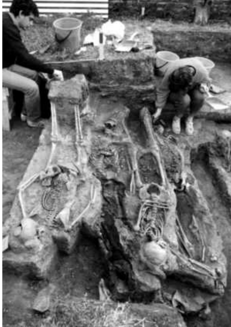
EAAF members Fondebrider and Bernardi working at a mass grave, Sector 134, Avellaneda.

Based on the cemetery records, the most plausible story seemed to be that bodies were transferred from morgue to grave, usually in groups, then covered over with earth not reaching the surface so that another layer of bodies might be deposited there after a period of a week, several months or a year. This resulted in a stratigraphy or levels, in which the skeletal remains were separated by layers of compacted earth. As exhumations proceeded, we observed precisely that pattern. We found two basic types of grave: “synchronic” and “diachronic.” Synchronic graves are those in which the bodies seem to have been deposited during the same temporal event, since there are no