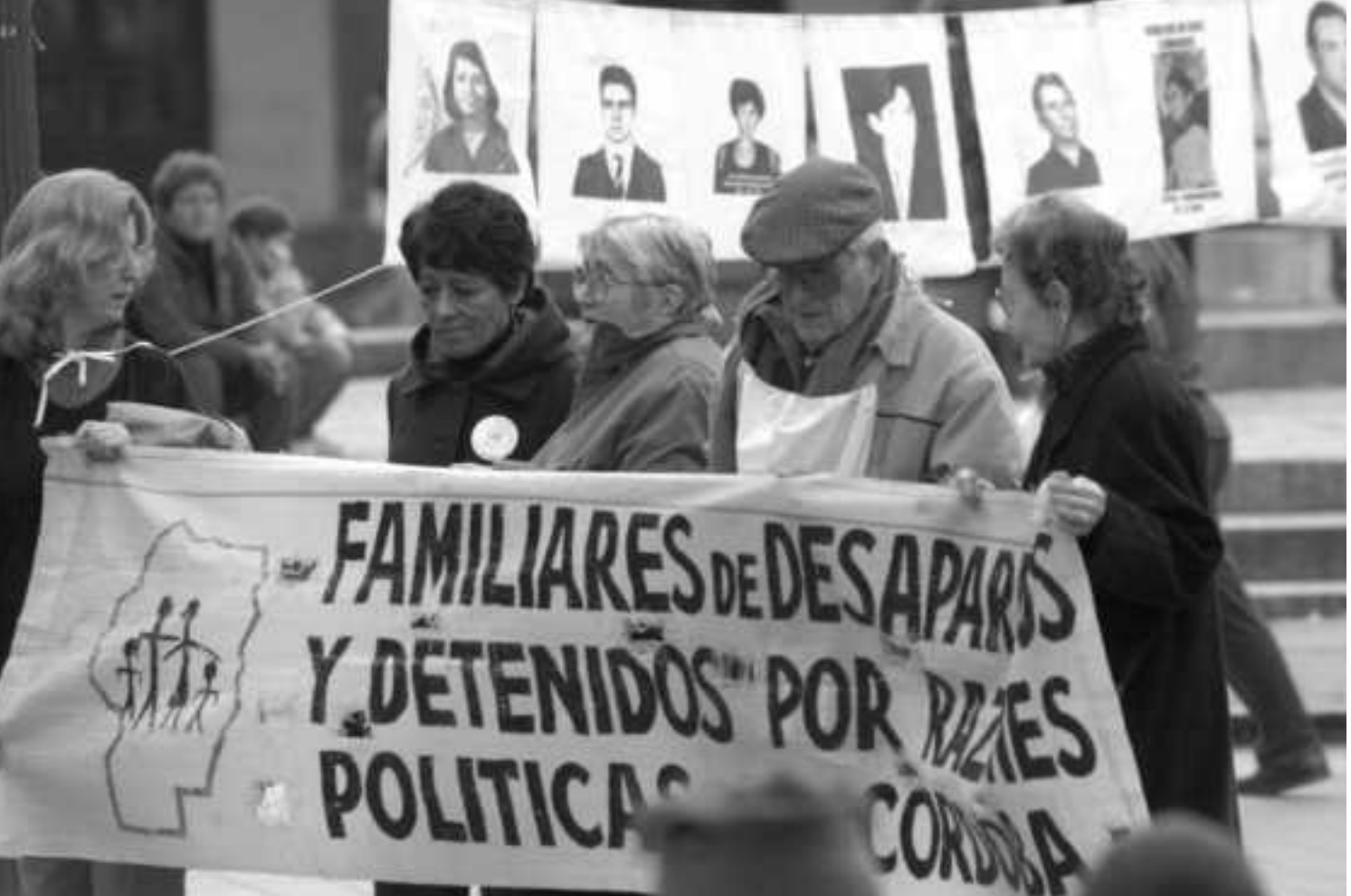
February 2003. Demonstration of human rights organizations and associations of families of disappeared people in the city of Córdoba.

Reconstruction of Argentina (ARHISTA) were crucial to the historical and documental investigation of the case.