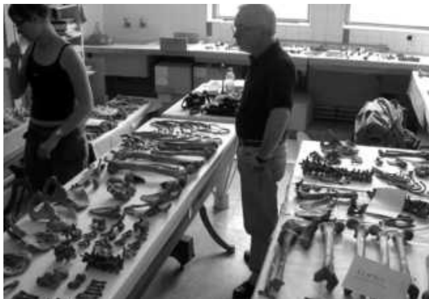
EAAF members and collaborators working at the Medical Examiners office of the city of La Plata. The remains correspond to exhumations conducted at the beginning of democracy without archaeological techniques, resulting in the mixing of individuals.