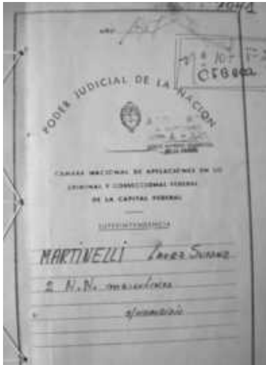
Top: Cemetery Registry, Bahía Blanca 1976-78 Bottom: Cover of Judiciary File (#1041): Name, Martinelli, Laura Susana - 2 NN Masculinos S/Homicidio, Bahía Blanca, Photos by EAAF.

grave because it contained the remains of more than one individual — a minimum number of four skulls were intermixed with a series of other disarticulated bones. This evidence — bones that were not in anatomical position and mixed — suggests disturbance after primary burial or that this was a secondary burial for these remains; that is to say, the remains were originally buried somewhere else and later transported to this burial site. In this case, some of the bones were also deposited in various levels of the ground with layers of soil in between them that most likely indicated temporal differences in the time of burial, consistent with a diachronic grave. The discovery of this type of burial in Grave No. 146 ran contrary to what was indicated in the records of the cemetery. But what ultimately led us to believe that the body buried in 1976 was no longer in Grave