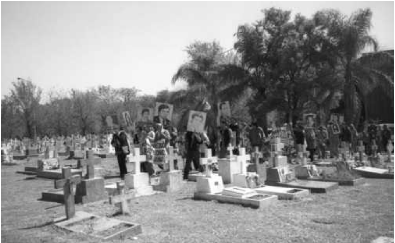
February 2003. Human rights organizations and associations of families of disappeared people holding the photos of their loved ones at the San Vicente Cemetery, Córdoba, Córdoba Province.

families. Police physicians were responsible for signing the death certificates.