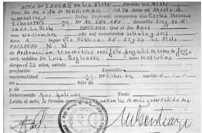
Examples of historical documentation EAAF uses in making identifications. Left, press clipping from the now-defunct newspaper La Opinión announcing the discovery of thirty bodies in Pilar, province of Buenos Aires, in 1976. Right : A typical "N.N." death certificate, probably corresponding to a disappeared person based on the cause of death (gunshot wound to the head), age (23) and date (November 16, 1976, at the height of the repression).

The process of identification proceeds from the original fingerprint match. After the first stage of identification is reached, EAAF sends the information to the Federal Chamber of the Federal Capital so that they can officially authorize the identification, communicate with the relatives of the victims and begin the process of finding the cemetery where the remains may still be buried. Regrettably, in some cases, the remains had already been exhumed from their individual tombs by cemetery personnel and sent to the general ossuary of the cemetery. There we can no longer recover them because thousands of bones are mixed together. By municipal decree, this is done after five or ten years if grave charges are unpaid as is typical in cases of indigents and “John/Jane Doe.”