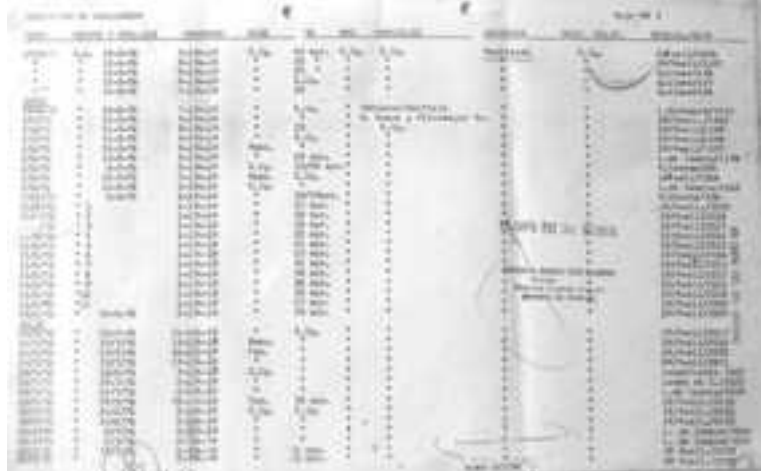
Cemetery Registry from Avellaneda Cemetery, Province of Buenos Aires, showing young “NN”s who died in the first months after the military coup.