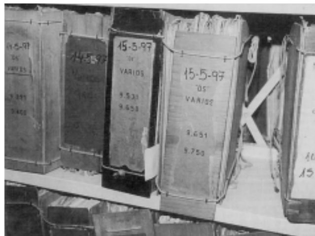
At the Archives from the Provincial Police of Buenos Aires, folders with 'intelligence' activity reports were kept until 1997 under categories such as Subversive Delinquency (DS).

The data contained in the archive show the subordinate and hybrid character of the Provincial Police's authority and activities at that time. First,