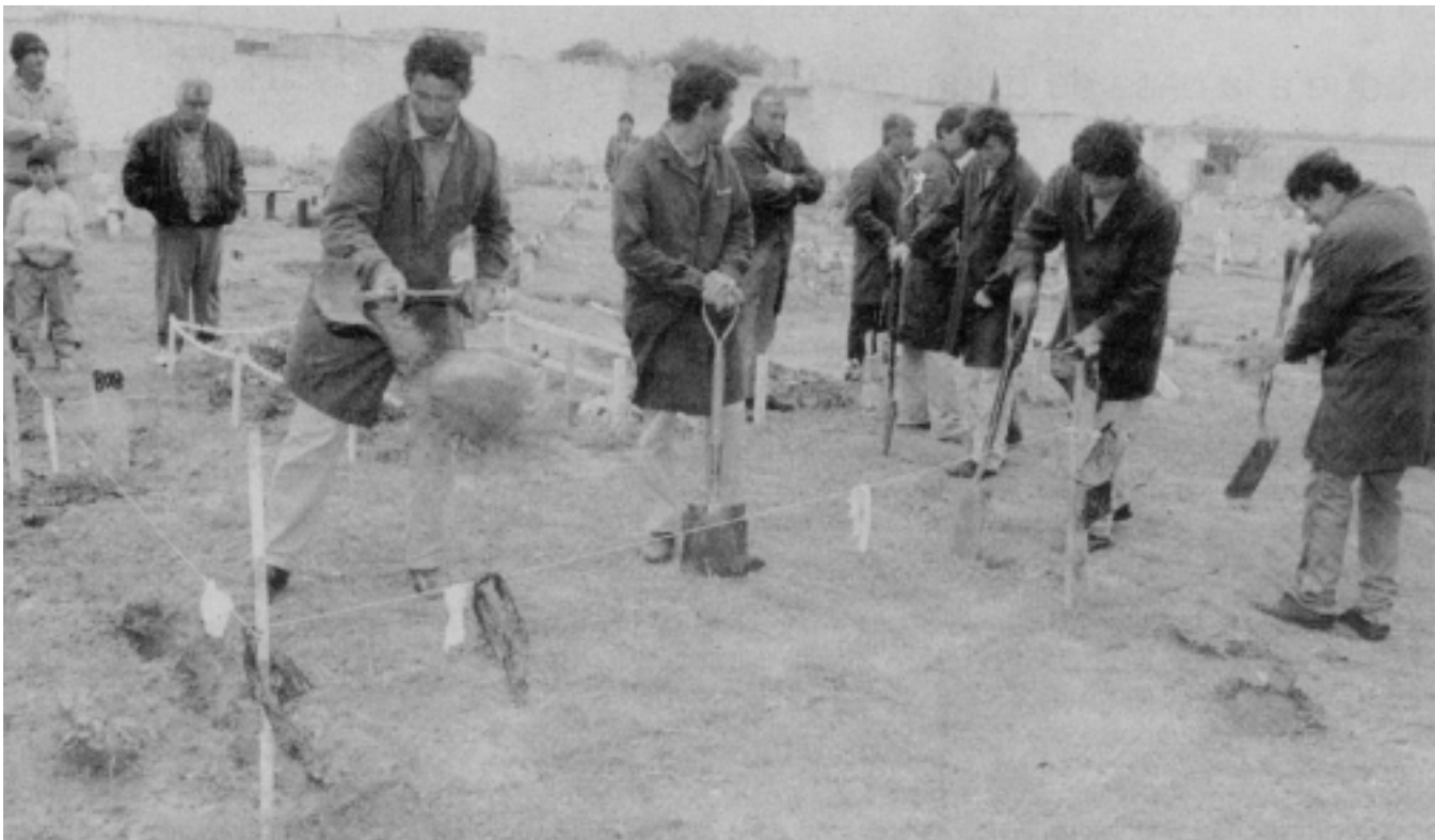
Inmates participating in the excavatioin at Santa Fé cemetery.

In 1999, the relatives of Oviedo and Vuistaz requested the intervention of EAAF to the Federal Court number 1, from the province of Santa Fe (files no. 464/98 and 447/99), in charge of the investigation. In order to find the remains of